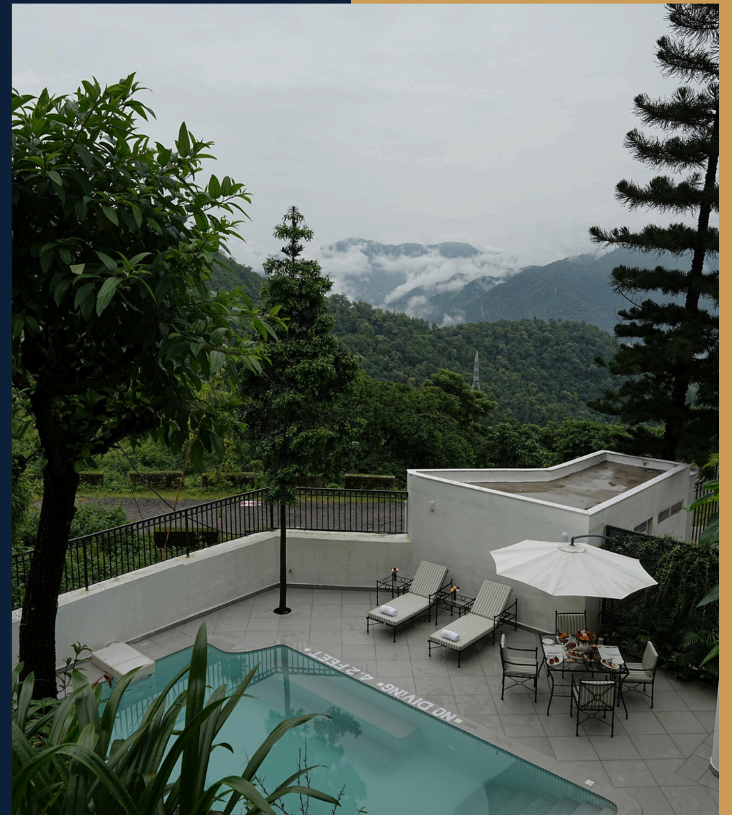
KINWANI HOUSE, ARAIYA ANTHOLOGY

Dedicated to sustainability and community engagement, Araiya goes beyond service to foster lasting relationships and leaving a positive impact. Join us in discovering all India has to offer, where natural beauty meets divine hospitality. Journey with Araiya.