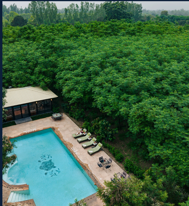
AALIA JUNGLE RETREAT AND SPA BANDARJUDH, HARIDWAR, UTTARAKHAND 11 Tents