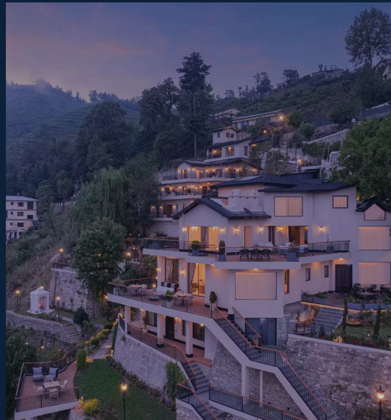
AMARAYA RESORT TAGORE TOP, NAINITAL UTTARAKHAND 11 Rooms & Suites