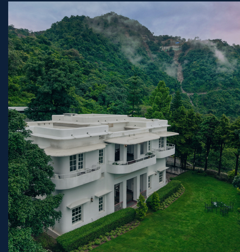
KINWANI HOUSE NARENDRANAGAR, RISHIKESH, UTTARAKHAND 06 Suites