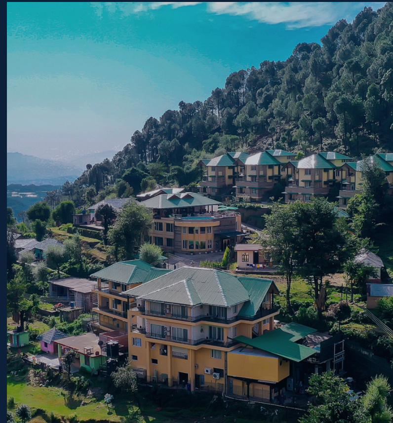
ARAIYA PALAMPUR A NORWOOD HEIGHTS RESORT HIMACHAL PRADESH 38 Rooms